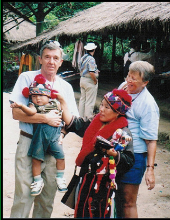
Thailand - 2003