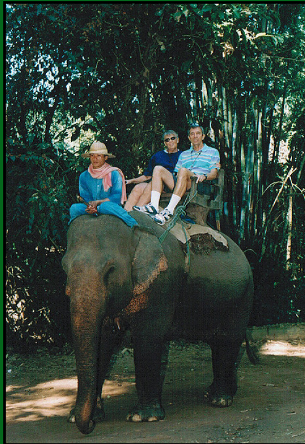
Chiangmai, Thailand - 2003