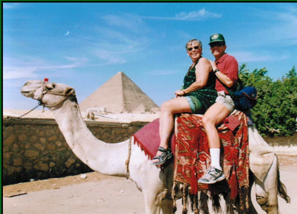
Great Pyramids of Giza, Egypt - 2004