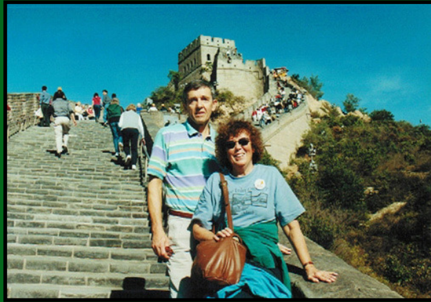
Great Wall of China - 2000

But we make time on our schedule for travel. Some of the countries we have visited include Australia, New Zealand, Fiji, China, Laos, Myanmar, Thailand, France, Germany, Netherlands, Austria, Croatia, Bosnia Herzegovina, Bulgaria, Rumania, Hungry, Egypt, Slovenia, Russia, Italy, Jamaica, Mexico and numerous Caribbean Islands on 8 cruises, and counting.