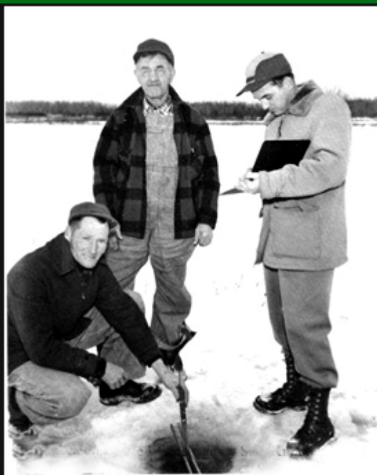
Lake Winnebago Creel Check 1952

One Saturday, he drove to Madison to take the Aquatic Biology test, later returned for the orals, and was hired to