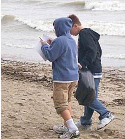
These students worked on a class project while on a field trip to Lake Michigan.

"It is more important than ever that we work together to provide low-cost, high-return learning opportunities that help to prepare every student for success in our rapidly changing world," said Evers. "This plan suggests ways to share information and experiences on how schools and districts have achieved cost savings through educational projects that reduce consumption and increase efficiency. It also emphasizes increased collaboration to advance student academic achievement in core subject areas."