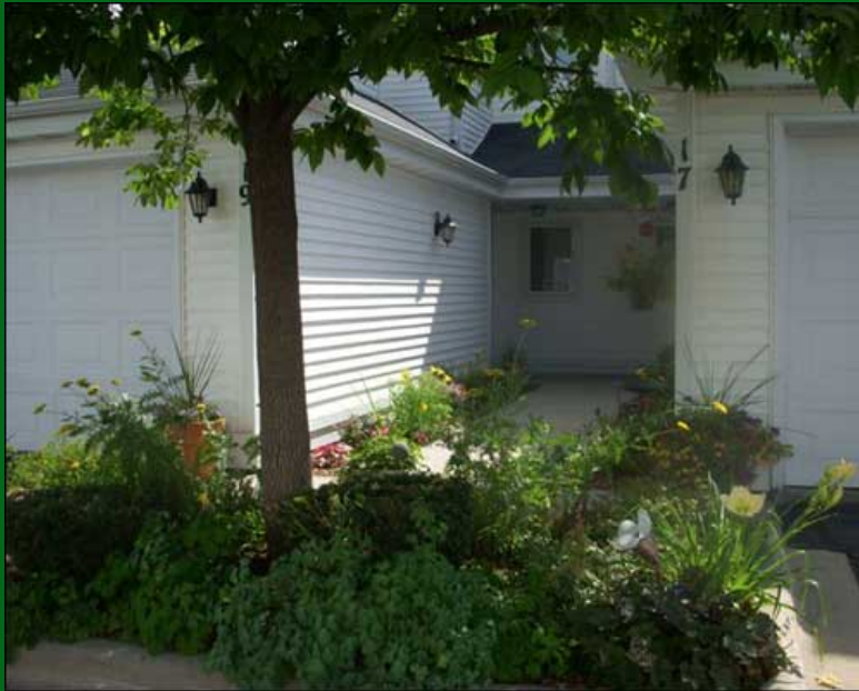
Landscaping committees work at Linda's condo