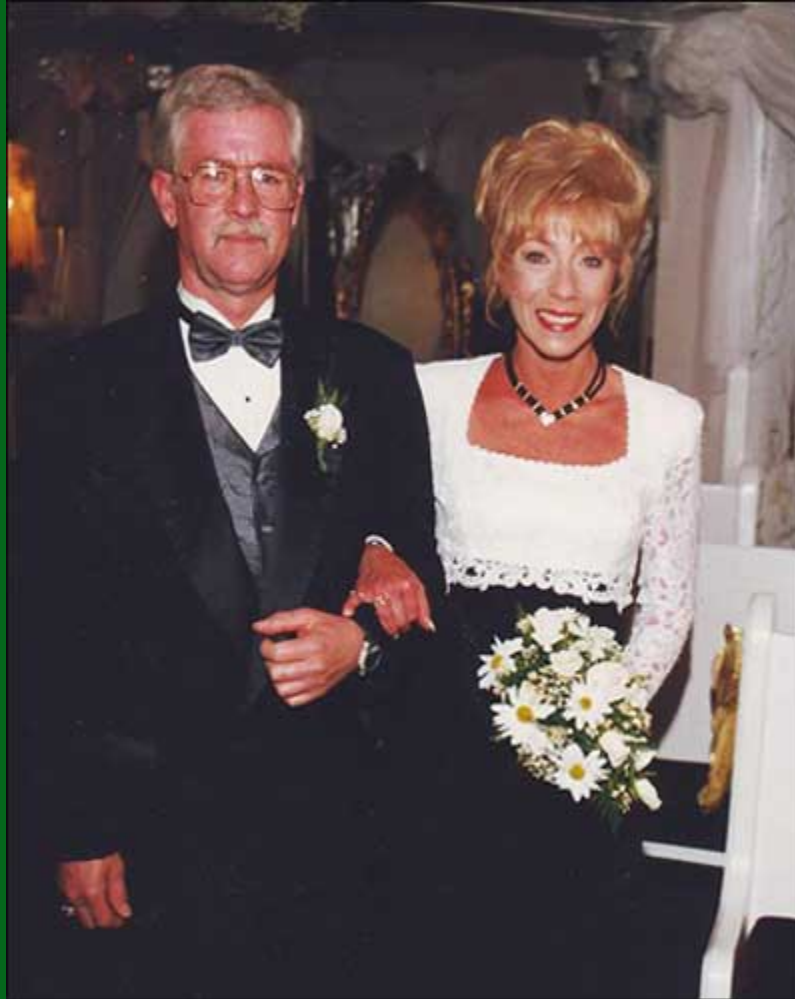
Little White Chapel, Las Vegas