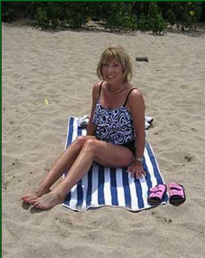
Soaking up the sun in Hawaii