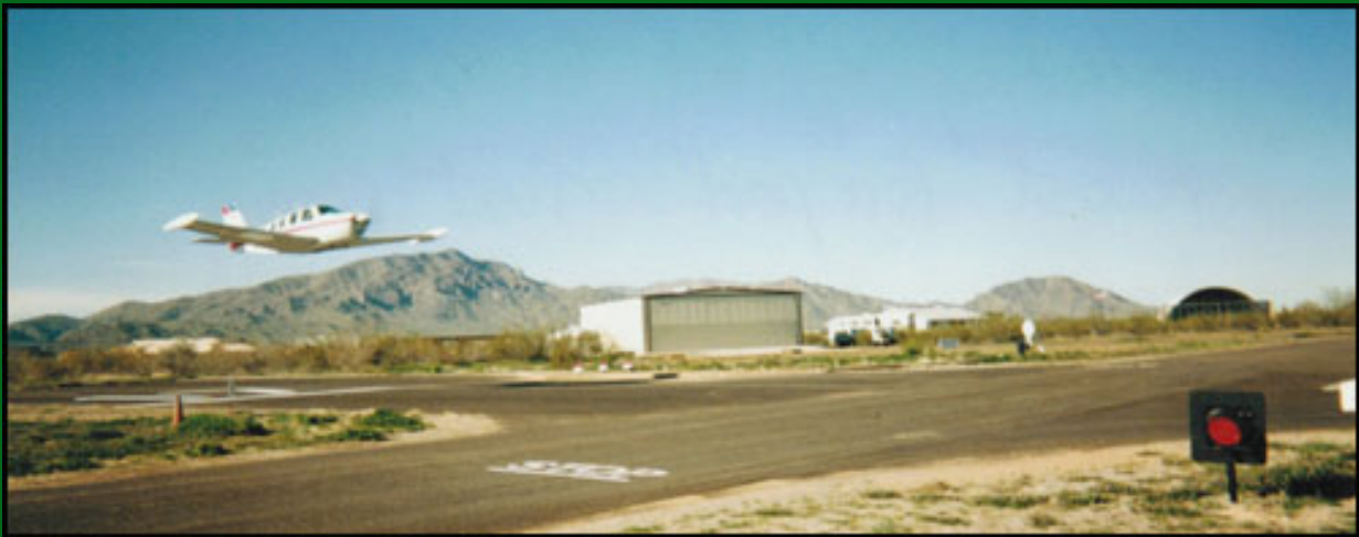
The Bancroft Arizona Ranch complete with airstrip.

When Bill retired we built a home in Arizona for the winters. Our home there was located in an air park so we could fly from our strip at the farm to Aguila, Az.