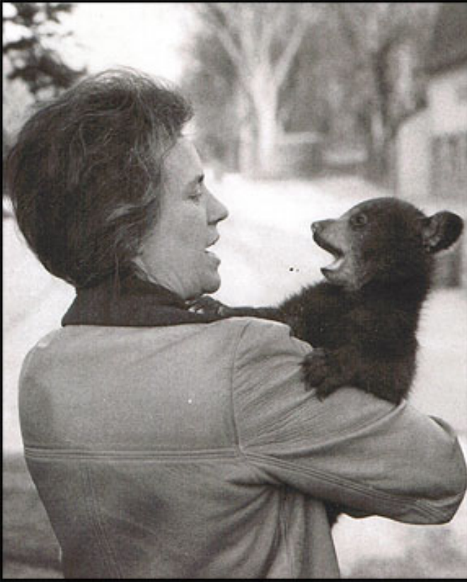
One of the McKenzie residents

In 1972 I went to work for the DNR at the McKenzie Environmental Center where I was assistant manager then manager until 1986. I also ran the 34 acre DNR exhibit at the Wisconsin State Fair grounds. I also served on the State Scientific Board, at MEC. We belonged to the Wisconsin Zoo Association and the AAZPG for the purpose of finding homes for the many extra animals that came to the MEC as well as to help educate others of the DNR management