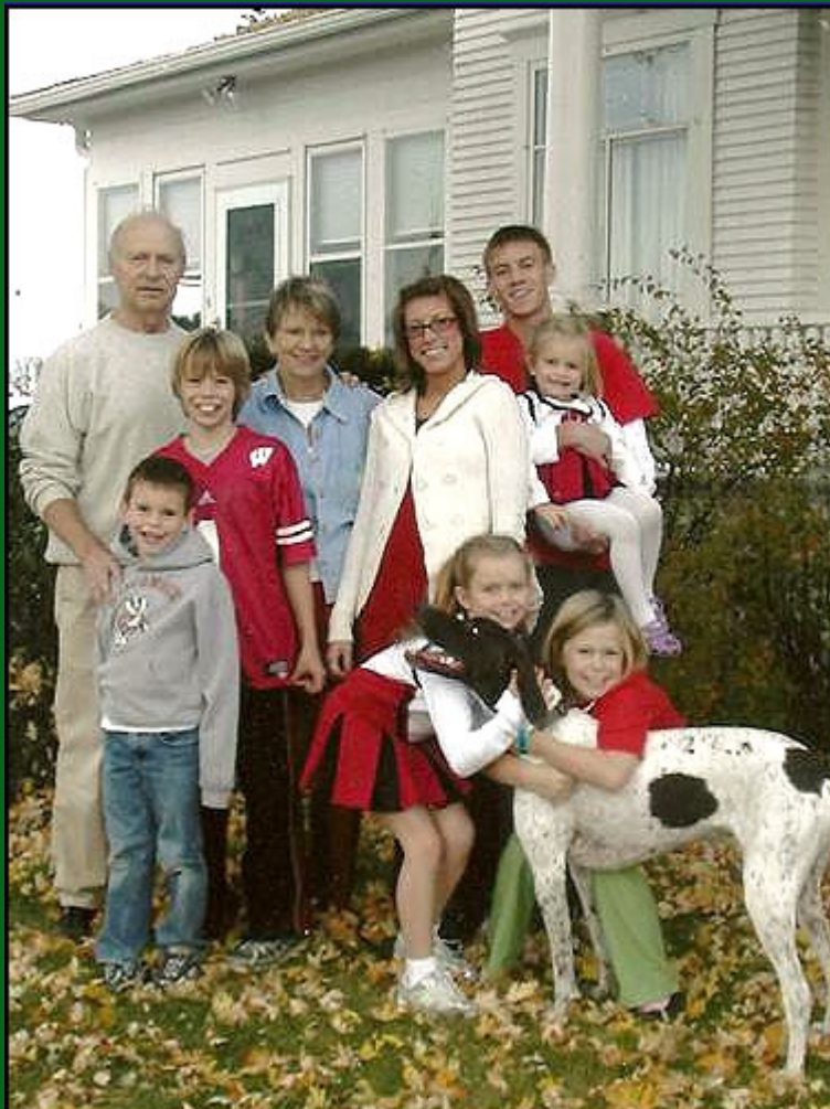
Grandpa and Grandma with Grandchildren and Max the Dog.