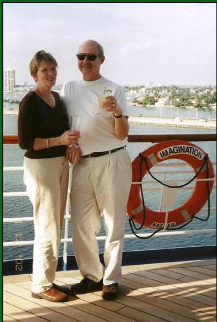
Carnival cruise in the Caribbean with a group of friends. 2002