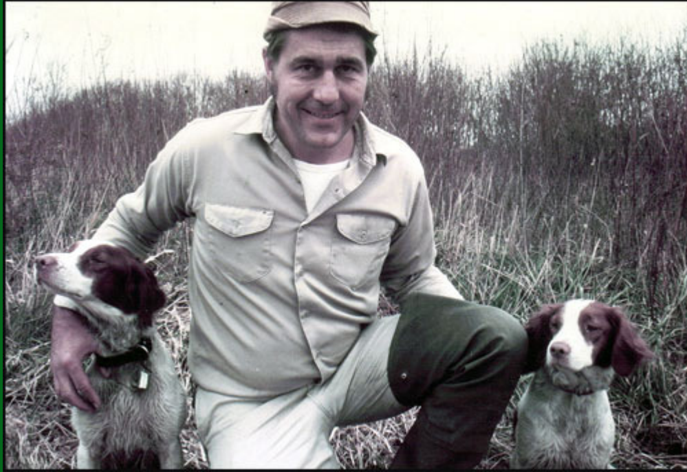
Pheasant Hunting 1970's