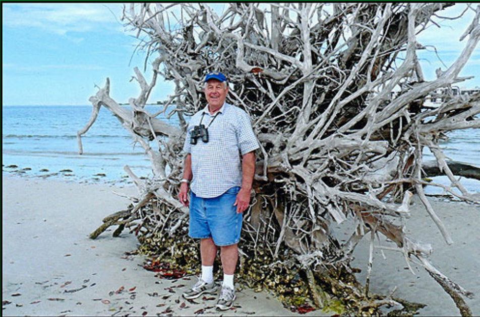
Lovers Key, Florida March 2013