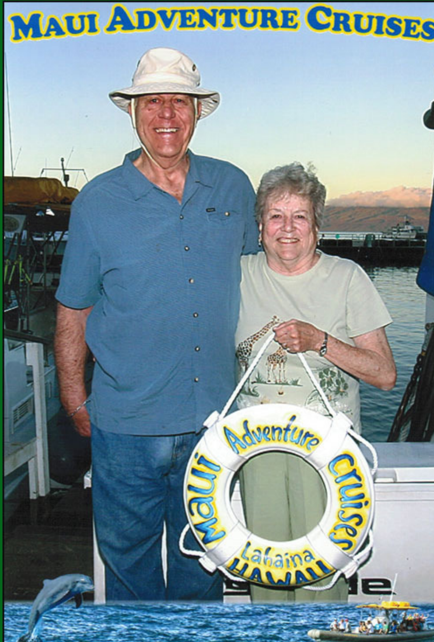
Hawaii Whale Watching Cruise January 2014

They often spend about a month near Bonita Springs, Florida partying with other Retirees in Feb. or March. In the past they have spent a week or more in Florida, Alaska, Hawaii, Minnesota, Michigan, New Mexico, California, Arizona, Washington, Nevada and New Hampshire. They can't think of any