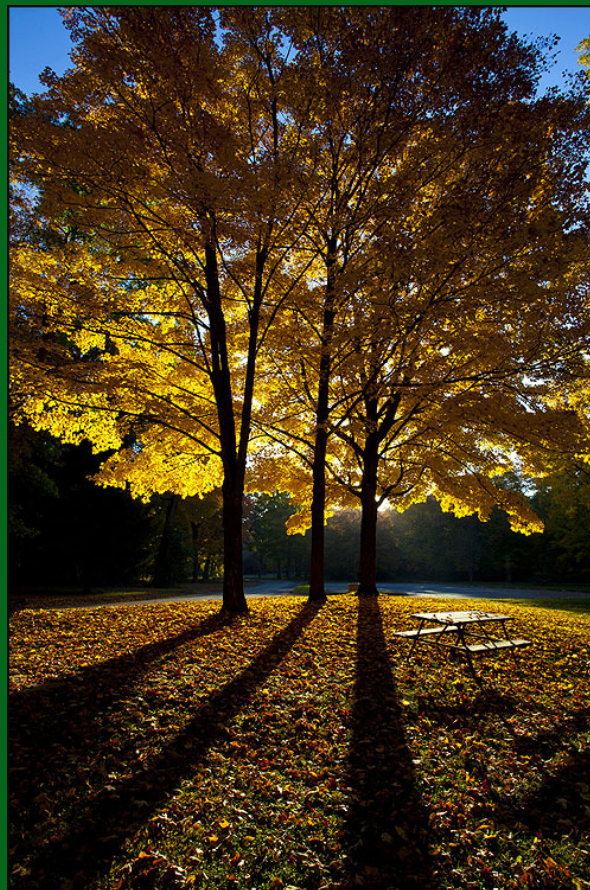
Devil's Lake Park, Baraboo, WI 2008