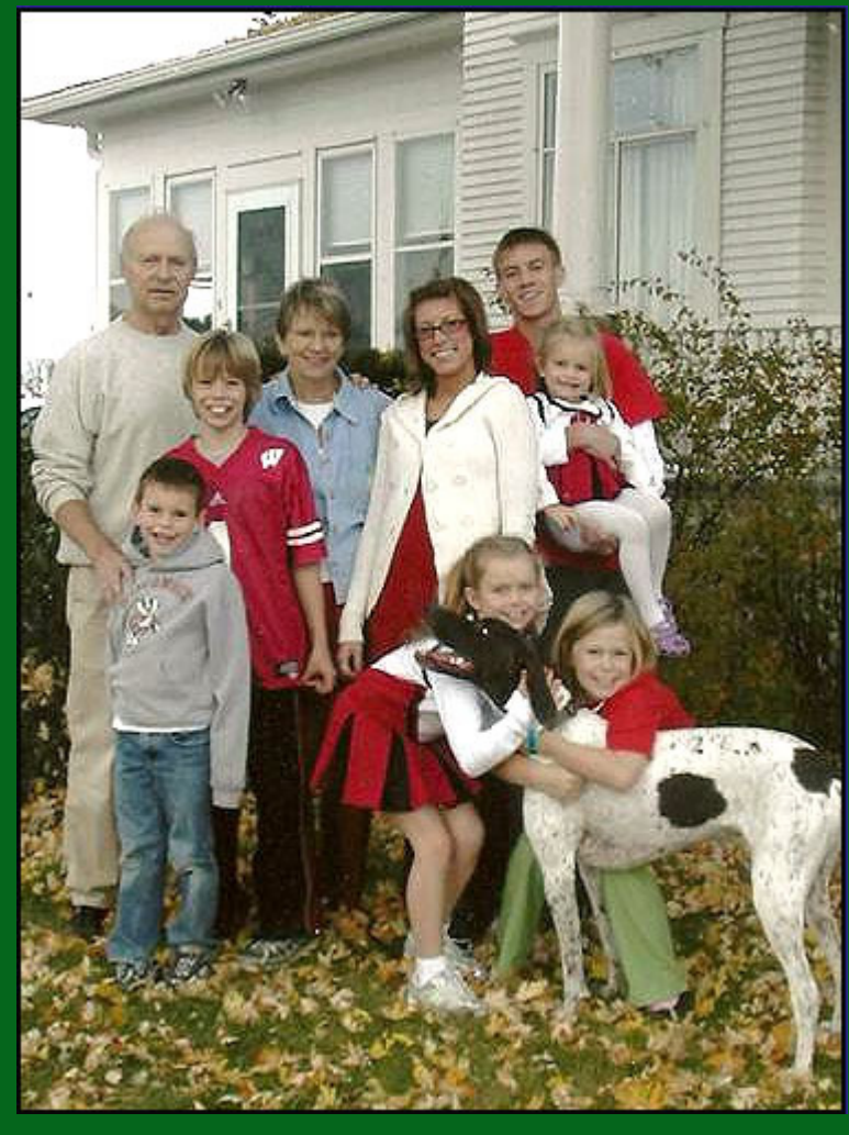
Grandpa and Grandma with Grandchildren and Max the Dog.