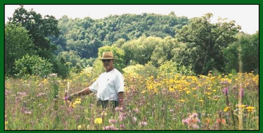
This prairie was planted in the mid-1990's while I was still working. It is planted adjacent to the farmstead and has a nice mix of prairie plants. We maintain it regularly with vigorous burning. 2005